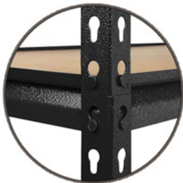
DIRECTLY CONNECT UPRIGHT