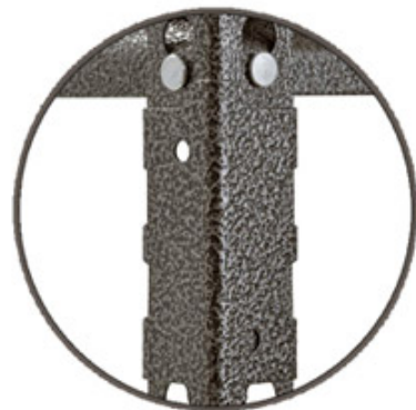
EXTRA SAFETY CONNECTOR