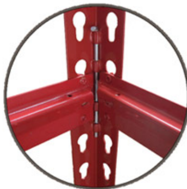
SAFETY PIN CONNECTOR