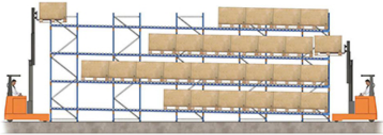
FIFO first in, first out pallet slotting on pallet flow racks