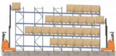
FIFO first in, first out pallet slotting on pallet flow racks